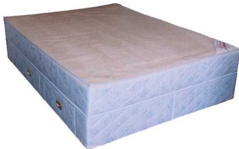
4 Draw Ensemble Gel Bed.

We can make a Gel soft sided bed to fit any existing Frame. Or to a custom height for customers with hip conditions.